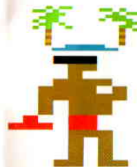
Prince drinks at an oasis

One foe of the Son of Egypt travels with him always: thirst. The longer he goes without refreshment, the greater his thirst grows. As it increases, he slows down. He cannot throw rocks as far. He must seek water or become easy prey to thieves, scorpions and the dread god Anubis!