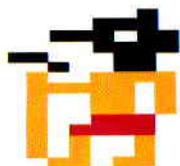
the evil god Anubis

Anubis, god of the land of the dead, faithful guardian of tombs, must be avoided or he will seriously wound the son of Egypt. The merest touch results in a wound. Anubis touches Prince: