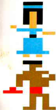
Prince meets the goddess Isis

The Prince also meets—or avoids—two desert deities: