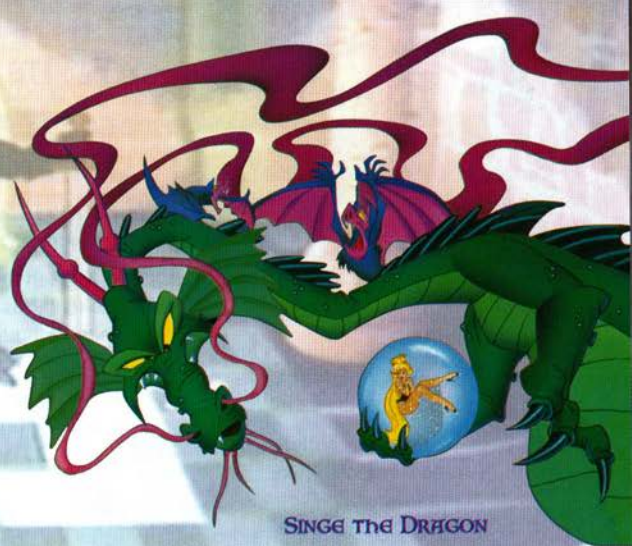
SINGE THE DRAGON