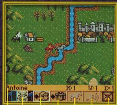
HERO NAME NEXT HERO MOVE HERO END TURN HERO PICTURE NEXT TOWN CAST SPELL

Press SELECT again to return to the game.