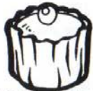
SHUMAI (Steamed Dumpling)