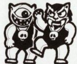
BOSS AREA 3