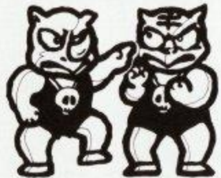
BOSS AREA 1