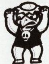
BOSS AREA 7