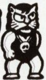
BOSS AREA 8