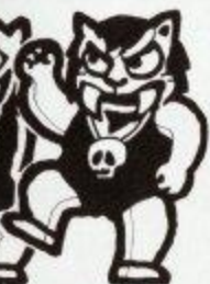
BOSS AREA 4