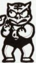
BOSS AREA 2