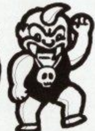
BOSS AREA 6