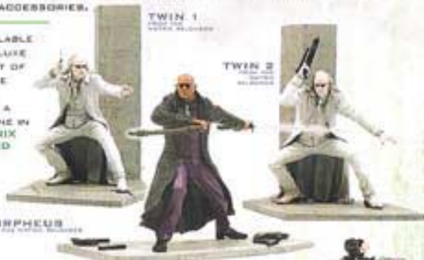
TWIN 1 FROM THE MATRIX RELOADED

ALSO AVAILABLE IS THE DELUXE BOXED SET OF NEG IN THE CHATEAU, BASED ON A FIGHT SCENE IN THE MATRIX RELOADED.