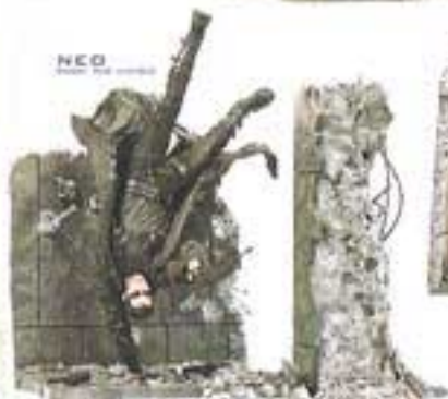
NEG FROM THE MATRIX RELOADED