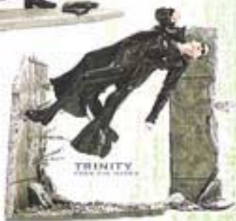
TRINITY FROM THE MATRIX RELOADED