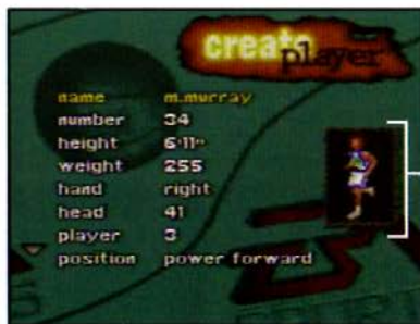
Picture of player

Control Pad ← to change highlighted option