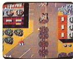
Stage Five: Rancho Mirage, California