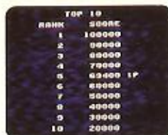
Way to go hotshot!

Once a player loses his/her last remaining fighter and has, in one player game only, exhausted the continue option, the game for that player is over. At this time, the top ten scores are indicated on the screen. If the player, that's you by the way, was a good enough pilot to be ranked in the top ten scores, his or her individual ranking will be indicated by their respective player number on the right hand side of the ranking list.