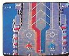
You're clear for take-off.

Now that you know what to do, let's jump into the game. The player or players, in the case of a two player game, begin their adventure from their special isolated "Raiden" fighter aerospace carrier just off shore from the first enemy camp. Be careful, the enemy onslaught could come at anytime. Be cautious I say!