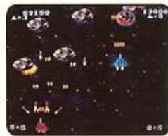
Stage Six: The Black Void of Death