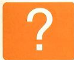
Stage Seven: The Mother Ship