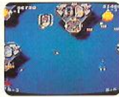
Stage Three: The Suez Canal