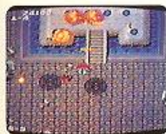
Stage Four: The Ruins of Ancient Greece