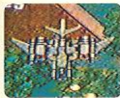
Stage One: The Bread Basket of America