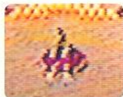
Maxed out red shot

There is some important information that every player should know about the Red and Blue shot icons. First of all, they are the same icon in that the icon will change its color over a period of a few seconds and then back again. When the color of the icon matches the color of the weapon you wish to obtain pick up the icon. Second of all, the more icons of a particular color (in this case red or blue) you pick up the better. The reason behind this is that if you stick to one color icon, you can max out your "Raiden" fighters weaponry for that particular icon.