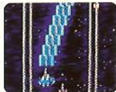
Maxed out blue shot

Note: If you are involved in a two player game try shooting the jet stream of the other player. A special weapon will appear that will knock your socks off. You have to see it to believe it!