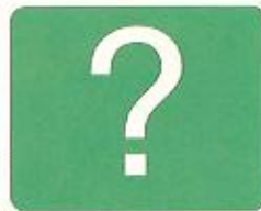
Stage Eight: The Planet of utter Carnage, Carnass, the source of the alien tyranny.

If you can defeat all eight stages of alien bombardment, earth will be saved and the Carnassials will be vanquished! Only you have the power to defeat such a vile nemesis, only you have the power of "Raiden!"