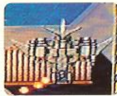
Stage Two: The Leveled City of Kyoto, Japan